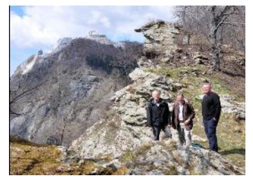
The Apuan Alps close to La Collina Del Sole