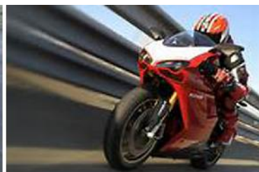
DUCATI Factory in Bologna - www.cimt.it/index.htm

http://www.ducati.com/history/editorials/the_ducati_museum__thrilling_history/index.do